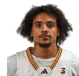
4 TALFORD Sr. ▶ Forward

MIN. 25.5 PPG 14.2 RPG 6.1 APG 1.1 FG% 50.9 3FG% 37.0